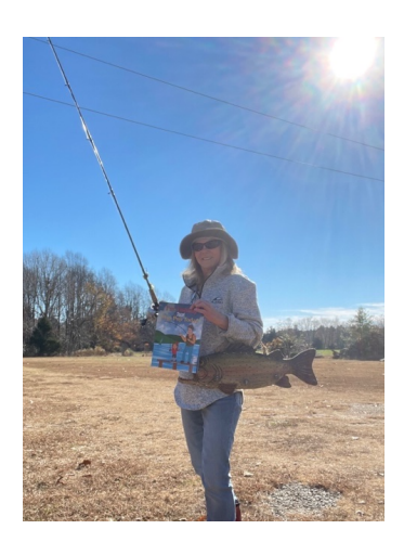
I'm Fishing with Pop-Pop Today, Austin Macauley Publishers, Ltd., 2022.